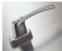
Handles with a key