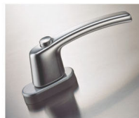
Handles with a button